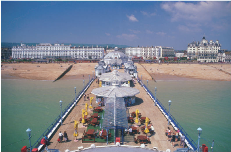
Eastbourne seafront from the pier.