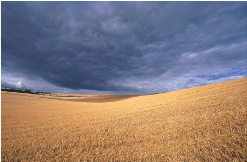
Storm clouds near Denton.